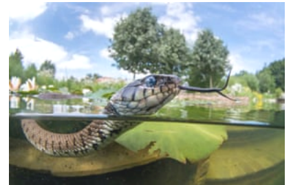
British Waters Wide Angle category runner-up - Grass snake swimming along a garden pond