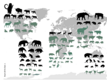
The lost megafauna

Near misses from extinction include the North American bison. And of course there is a need to be concerned about what might be the next species to go -African elephant, black rhino, snow leopard, tiger?